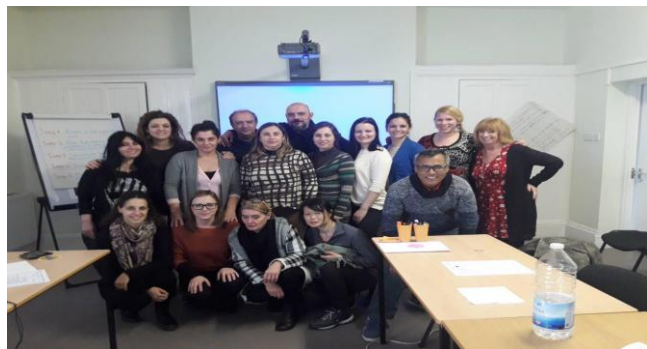
The DAUPR team in Plymouth

The training meeting ended with a lecture regarding language and authority.